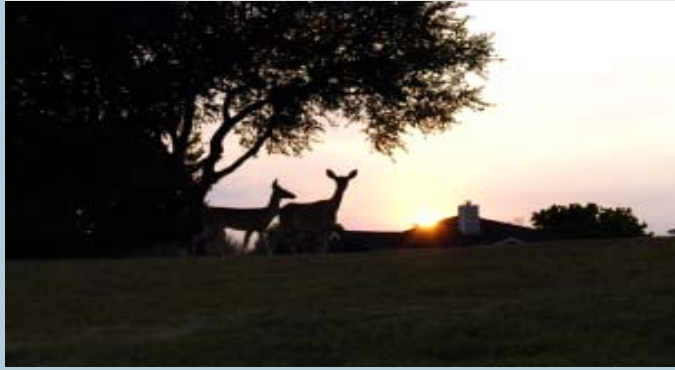
Deer strolling along the golf course at sunset.

Our accommodations feature a studio or motel style room. When the A and B sides are combined this creates a suite (see room floor plan).